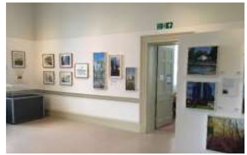
Gallery 1st floor